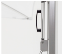
Manual Piston Assisted Lift