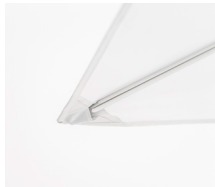
Ballistic Reinforced Screw Pocket Construction