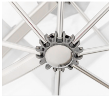
Patented Independent Bracket Hub System