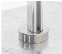
Stem Cover Plate