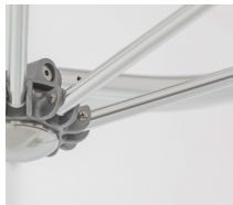
Easily Replaceable Parts