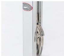
Cam Lock Lever - Allows 360° Rotation